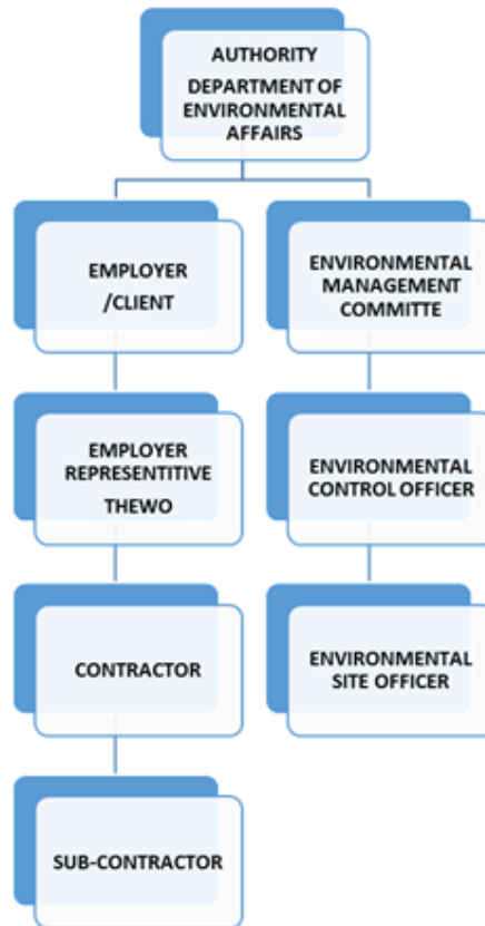
Figure 1: EMP implementation organisational structure.